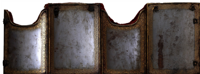
CHEST-PLATE ( WITH 4 DIVISIONS )